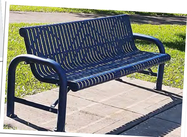
▲ 971-303 Grand Contour 6' bench in laser cut steel