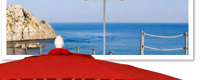
▲ 7.5′ Market Style with Logo Red canopy and white aluminum pole

Not seeing the fabric color you want? Give us a call and let us know what you need!