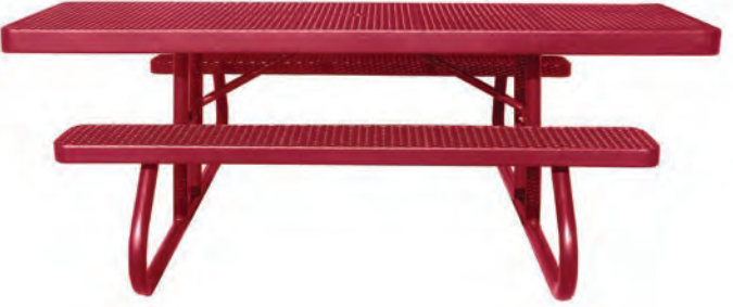
▲ 950-501 free standing 8' accessible table with expanded metal surfaces