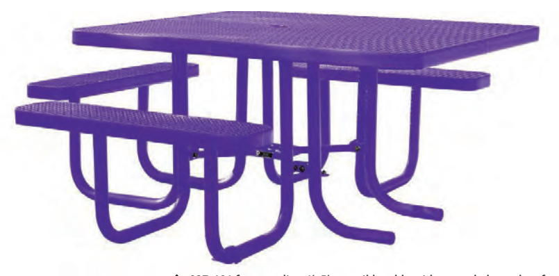
◆ 927-101 free standing 4'x5' accessible table with expanded metal surfaces

The seats are centered to provide wheelchair space on each end of the table.