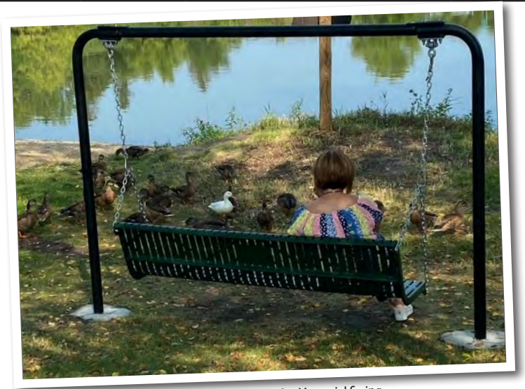
▲ 971-SM2 6' Laser Cut Memorial Swing