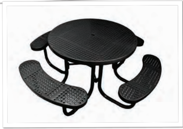
955-1P1 Free standing table with ____ perforated steel surfaces .