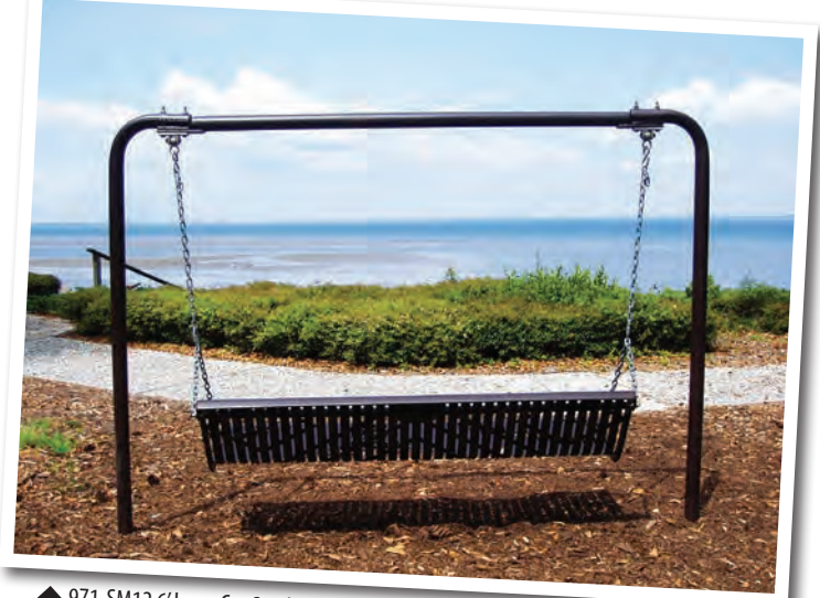
◆ 971-SM12 6' Laser Cut Steel Memorial Swing

Premier Polysteel Grand Contour swings are the perfect blend of form and function. The one-piece contoured swing is completely coated with UV stable, mold resistant poly-vinyl. Seat surface options include expanded metal, welded rod, or laser cut steel patterns. Heavy-duty poly-vinyl coated steel pipe supports the swing. Commercial grade cast iron hinges round out the durable construction. The swings are also available in Memorial styles.