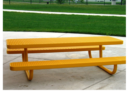
941-301 6' Free Standing Expanded Metal Top and Seats