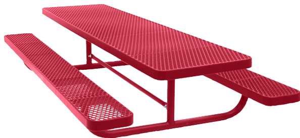
941-501 8' Free Standing Expanded Metal Top and Seats