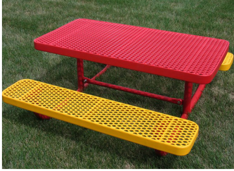
941-101 4' Free Standing Expanded Metal Top and Seats