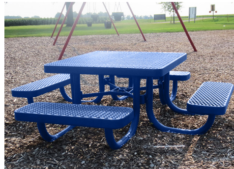
944-091 3' Square Free Standing Expanded Metal Top and Seats